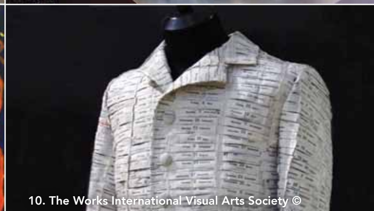
10. The Works International Visual Arts Society ©