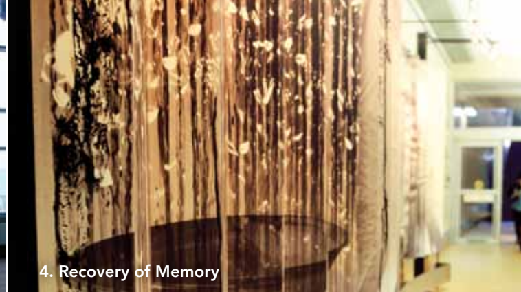
4. Recovery of Memory