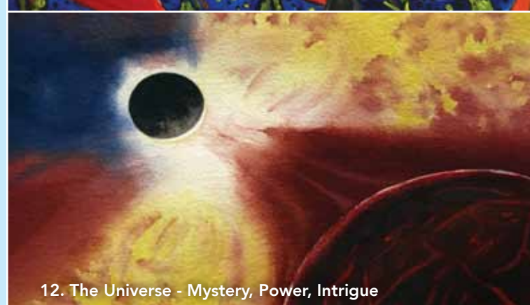
12. The Universe - Mystery, Power, Intrigue