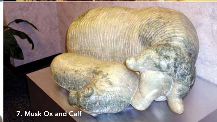
7. Musk Ox and Calf