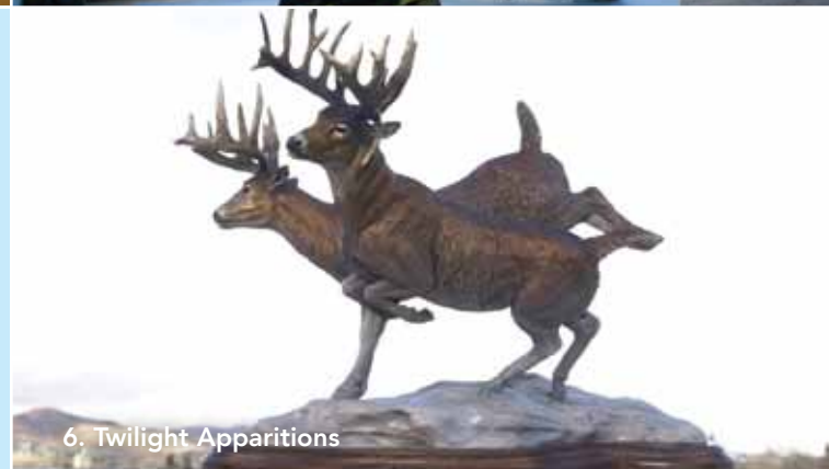
6. Twilight Apparitions