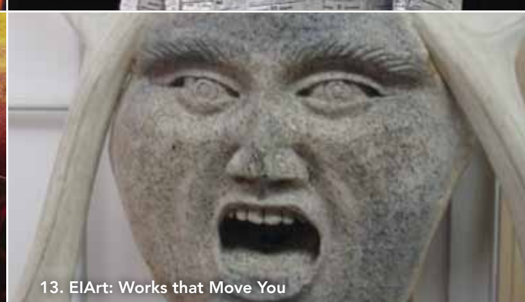
13. ElArt: Works that Move You