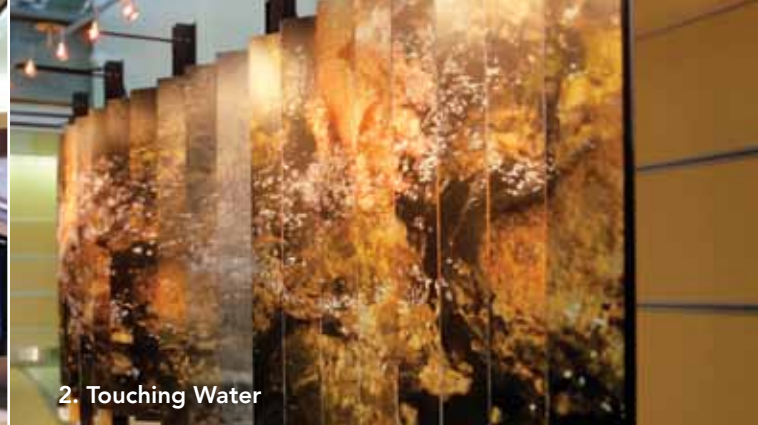
2. Touching Water