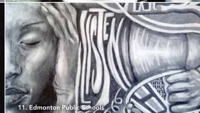
11. Edmonton Public Schools