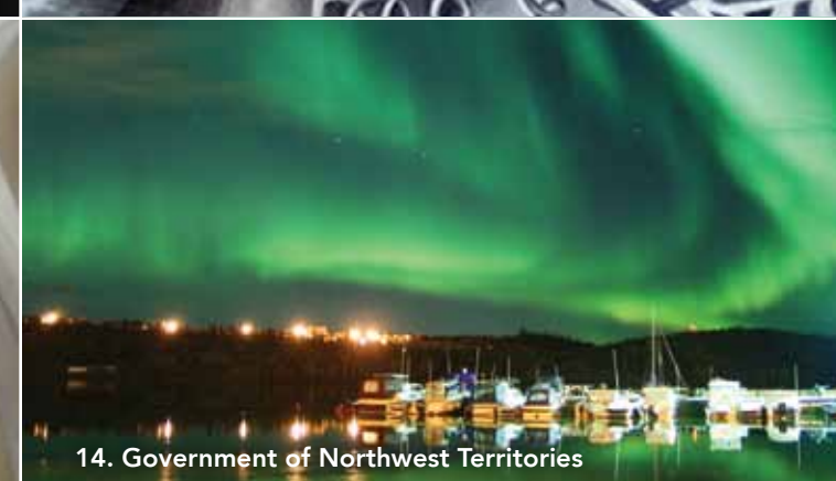
14. Government of Northwest Territories