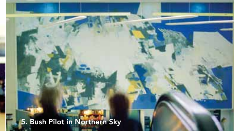
5. Bush Pilot in Northern Sky