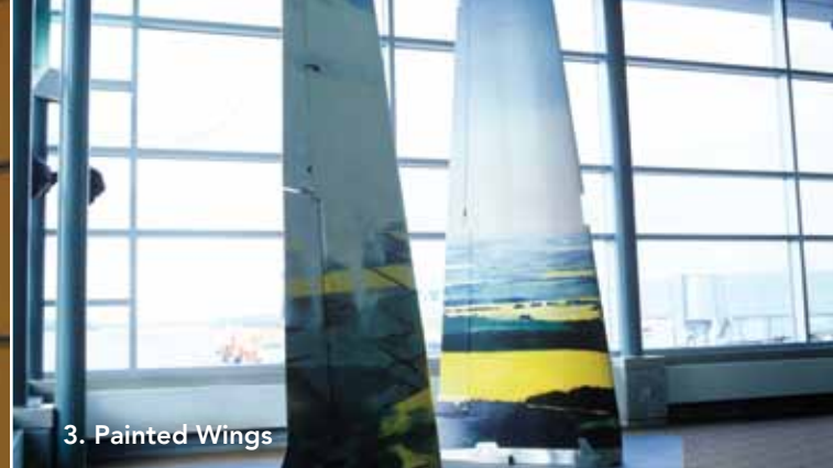
3. Painted Wings