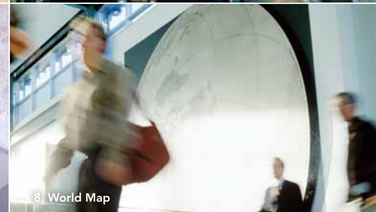
8. World Map